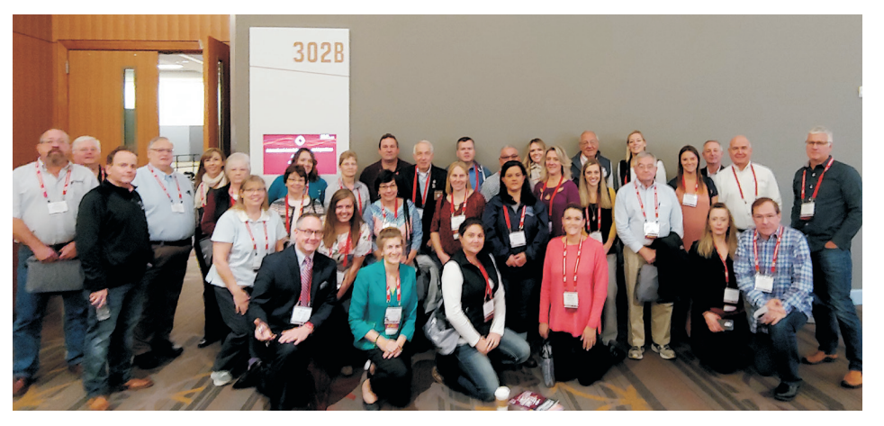
New York delegation at the IAFE Convention First Impressions Conference, San Antonio, Texas