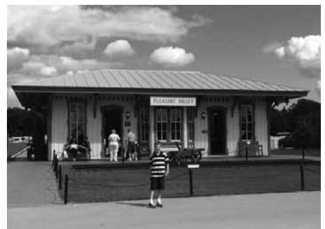
Pleasant Valley Railroad Station at the Dutchess County Fair