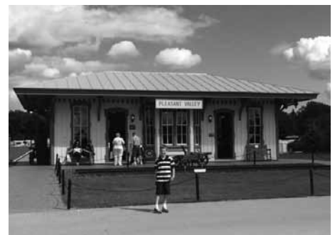
Pleasant Valley Railroad Station at the Dutchess County Fair