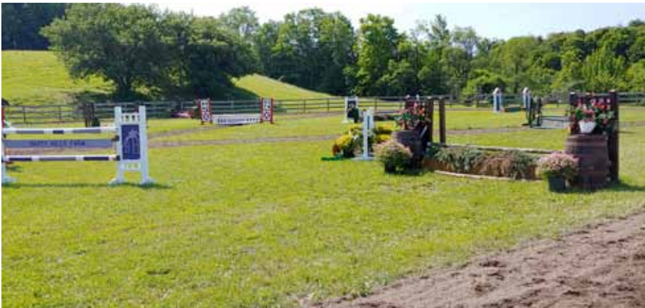
Genesee Valley Breeders Jump Course

Our Association welcomes back as a member Fair the Genesee Valley Breeders Association. Our Board of Directors voted to reinstate their membership in the NYSAAF at the Spring Board Meeting. The Breeders Association is an organization that is active in promoting the equine industry and its related activities. They will again be home at the Avon Driving Park in Avon, New York once the final upgrades are completed at the Driving Park. In the meantime they have been conducting their activities in the Western New York area.